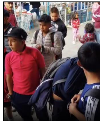
Arriving at the campaign site in the Mercado Kennedy