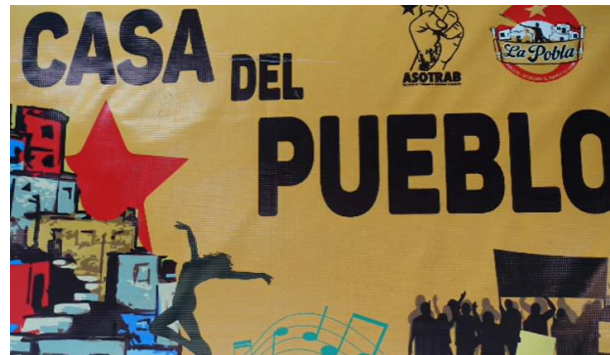
Above: street traders in the Comité del Pueblo area, Quito Below: waiting for attention in the entrance to the Casa del Pueblo