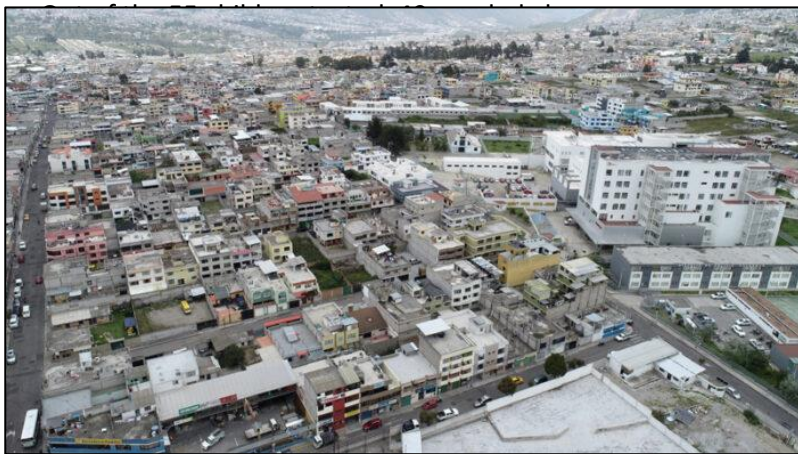
Above: Aerial view of Calderón, province of Quito

In September 2023, Letra para Todos contacted Vista para Todos to ask them for support by providing free eye tests and, where necessary, glasses. The school administrator said she had noticed not only that several children without glasses were having difficulty reading from the blackboard but also that a few children, whose parents had previously managed to buy them glasses, needed new glasses which their families could not now afford. The campaign took place on October 20th, and the glasses were handed over on October 27th.