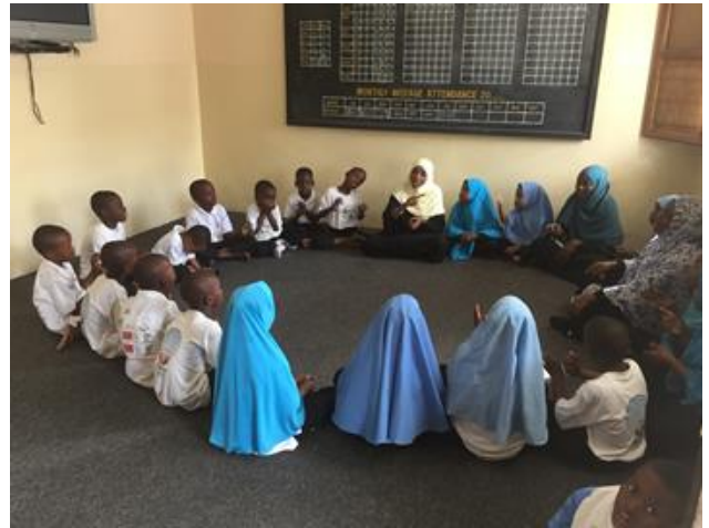
Classroom learning at the IZ/ZOP Academy

Students live as far as 20 km from the school, making safe, reliable, and affordable transportation a priority. The Academy's previous 14-seater bus was not only too small but also lacked seatbelts for every seat. This often required younger children to sit on the laps of teachers or parents during transit. While this practice aligns with