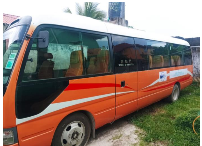
The new 26-seater school bus funded by Fondation Eagle

This funding was granted to purchase a new school bus for the IMPACT Zanzibar/ZOP (IZ/ZOP) Academy, IMPACT's specialised school in Zanzibar for children with hearing loss and additional needs. The new, larger bus is ensuring a safe and comfortable daily commute for students and teachers, as well as providing a reliable mode of transport for educational excursions. The bus has replaced the Academy's aging 14-seater minibus, which was no longer adequate for the growing needs of the school community.