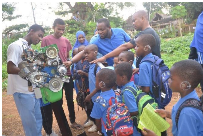
Above, the annual prize giving excursion in December 2024 and a trip to an agricultural festival to learn all about farming technology.