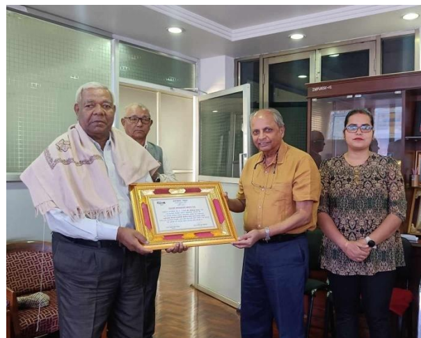
The land for the new Birthing Centre was gifted by a local philanthropist and the ownership has been formally transferred to IMPACT Nepal

Introduction: Your grant was awarded to construct a Birthing Centre in a rural part of Saptari District, where there are no existing women's health services. The aim of this project is to provide quality medical care for women during pregnancy, birth and the postnatal period, replicating the successful Eagle-funded project in Auraiya (File Form 0444-04). Ultimately it is planned that the Birthing Centre will become a hub for a wide-range of IMPACT initiatives to make motherhood safer and ensure child survival: including regular mother and baby clinics; door-to-door child health monitoring and vaccination record-keeping; nutritional support for malnourished families; Mothers' Clubs to promote home-gardening and key health messages; extra support and training for government health workers; a menstrual health project for women and girls; and the promotion of income-generating activities for women, such as livestock rearing and reusable sanitary pad making.