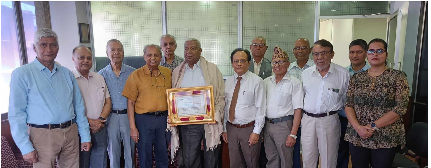
Top: The site where the Birthing Centre will be constructed and the construction team preparing the calculations