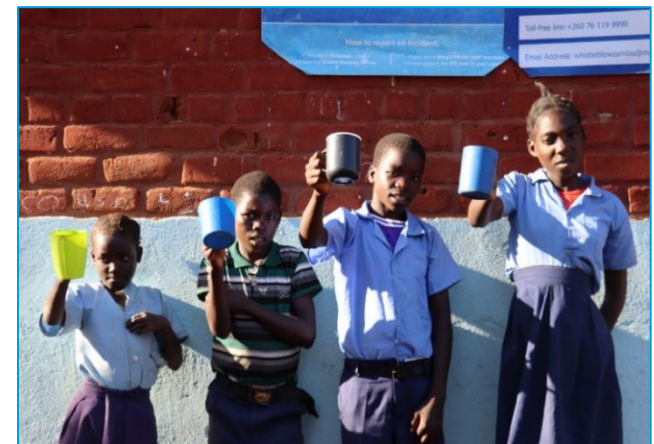
School children at Chadzuma School, enjoying their school meal!