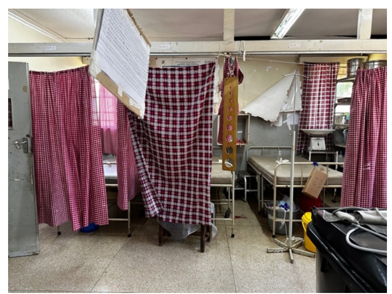
Above, the poor state of the delivery room and lack of equipment is evident.

Consultation with the Blantyre District Health Office took place earlier this year and the architect plans were approved by the Department of Health Management Team and by Blantyre District Council.