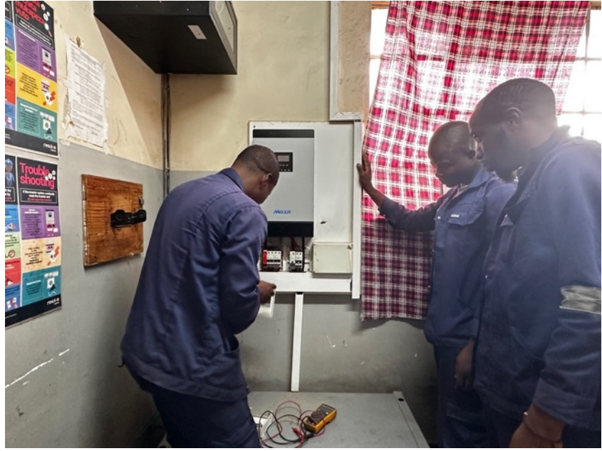
Solar technicians from Hi Tech inspecting the old and dysfunctional solar system.

The existing solar system is at least 12 years old and comprises four 12-volt acid batteries and 12 solar panels on the roof. AMECA asked Hi Tech, who installed the solar power system at The AMECA Health Centre at Chilaweni, to inspect the system. The 12 existing solar panels are working and in good condition, but new Lithium batteries and a new Inverter system are needed and will be purchased. Lithium batteries, although more expensive than lead/acid batteries, have a far longer life span and for this reason, we are purchasing Lithium batteries. Furthermore, following installation, Hi Tech will provide training for key senior staff at the maternity unit to ensure understanding, security and use of the system, as they did with the unit installed at Chilaweni.