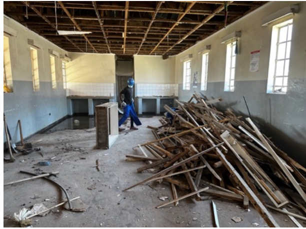
Removal of rotten timbers and old ceiling in postnatal ward