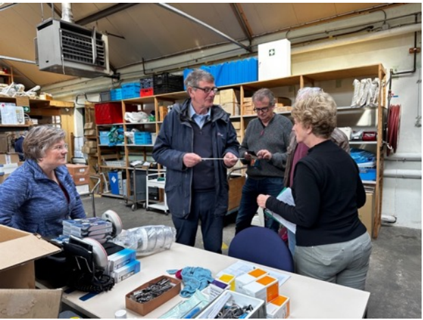
With AMECA Clinical Director, Medic staff and Dutch colleagues.

Due to the costs of shipment, larger items such as delivery beds etc were purchased in Malawi at Sakaramenta, (https://www.sakaramenta.com/care-collection.html) Refer to financial expenditure.