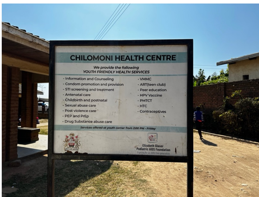
Surgical teaching visit.

Funding was granted by Foundation Eagle for the purposes of equipping and providing solar power for a maternity unit which AMECA is currently renovating at Chilomoni Health Centre, Blantyre.